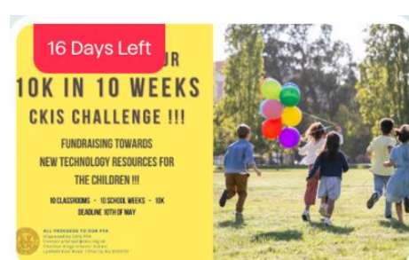
Yellow Class Mini London Marathon